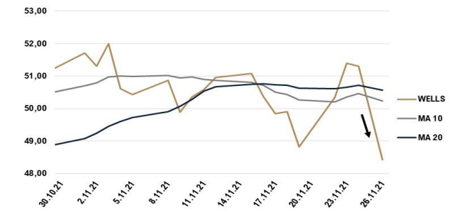
Figure 1: The Main Graph shows the stock's trend