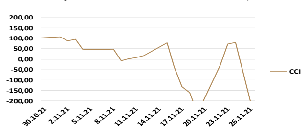
Figure 5: CCI Indicator drops below + 100 level.