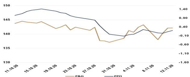
Figure 5: PPO crossed above zero-line