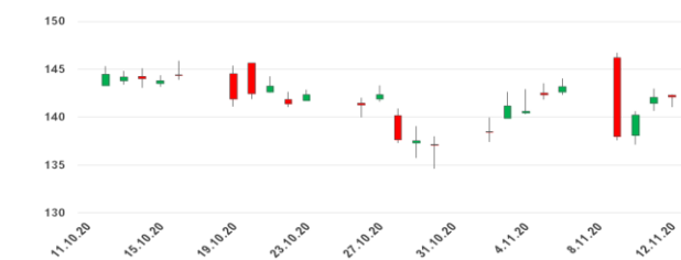
Figure 2: Candle chart shows the surplus of positive changes