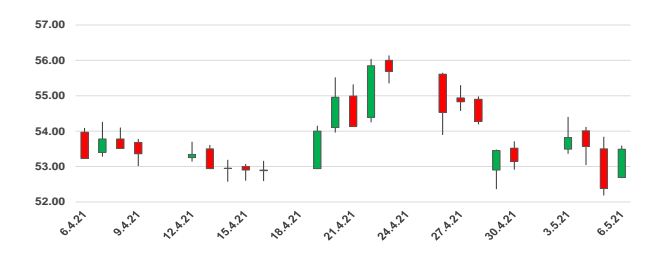
Figure 2: Candle chart indicates more negative changes.