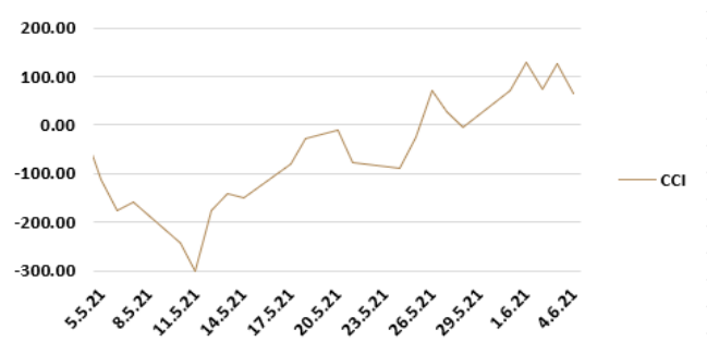
Figure 5: CCI Indicator is above + 100 level