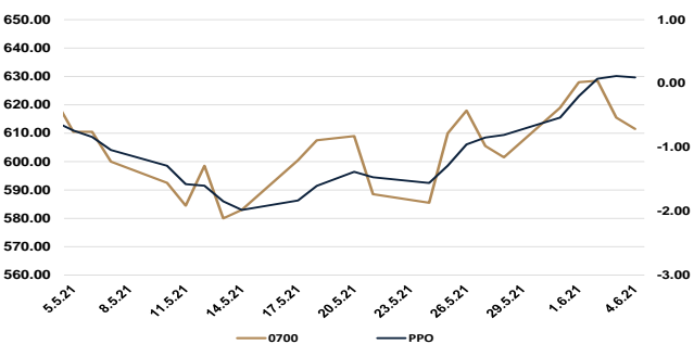
Figure 3: PPO is above zero line