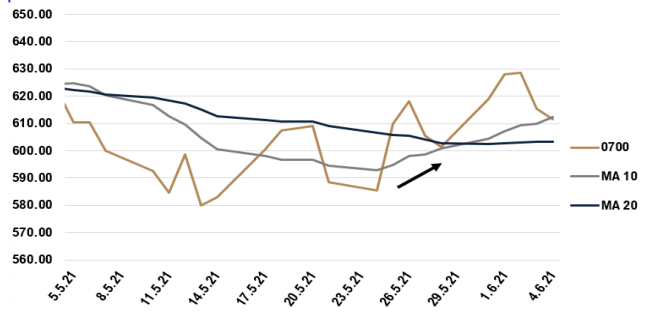
Figure 1: The Main Graph shows the stock's trend.